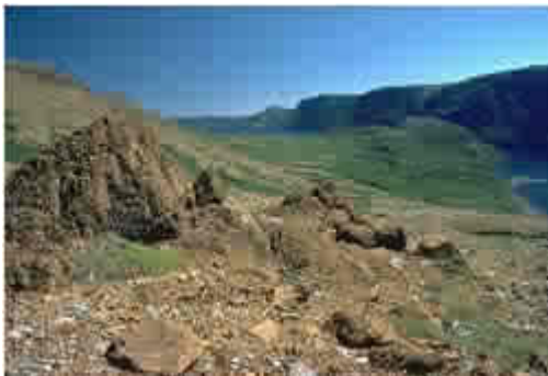
Tablelands, Trout River Pond, GMNP © Parks Canada / Greg Horne / 1172-082, G1-113

Join us in what National Geographic calls one of the most sustainable National Parks in North America, to improve your professional practice and become enriched and revitalized as you spend time in nature and with friends and colleagues.