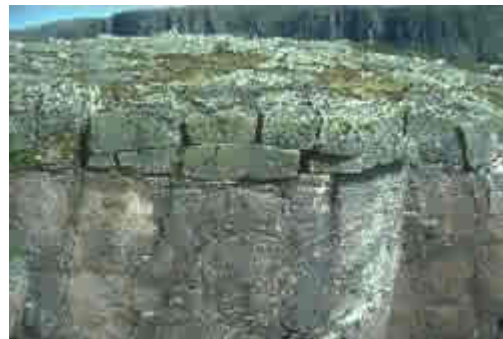
Granites on the Long Range mountains, Western Brook, GMNP